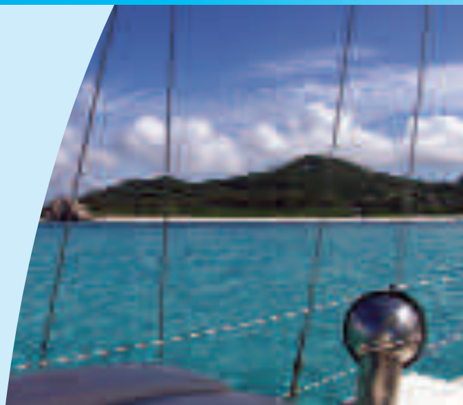
Crystal clear waters like these are what all sailors hope to preserve. Using technology like the electric propulsion system (below) can help.