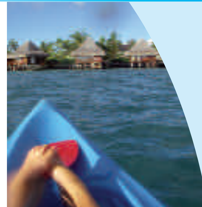
Watersports and beautiful tropical dwellings among swaying palm trees offer sailors and non-sailors alike the opportunity for luxury and relaxation on the islands of Tahiti.

She was welcoming us to "Le Tahaa Private Island Resort" and that was certainly what it was. The entire island was private and open only to guests yet she was allowing us to come and have a cocktail. She was so kind and spent at least an hour showing us around the island. There were only three private motus (over-the-water bungalows) and ten beach bungalows. The center of the island was graced with bright green flora as well as swaying palm trees. There were two small restaurants; one for the evening and the other for lunches. Couples