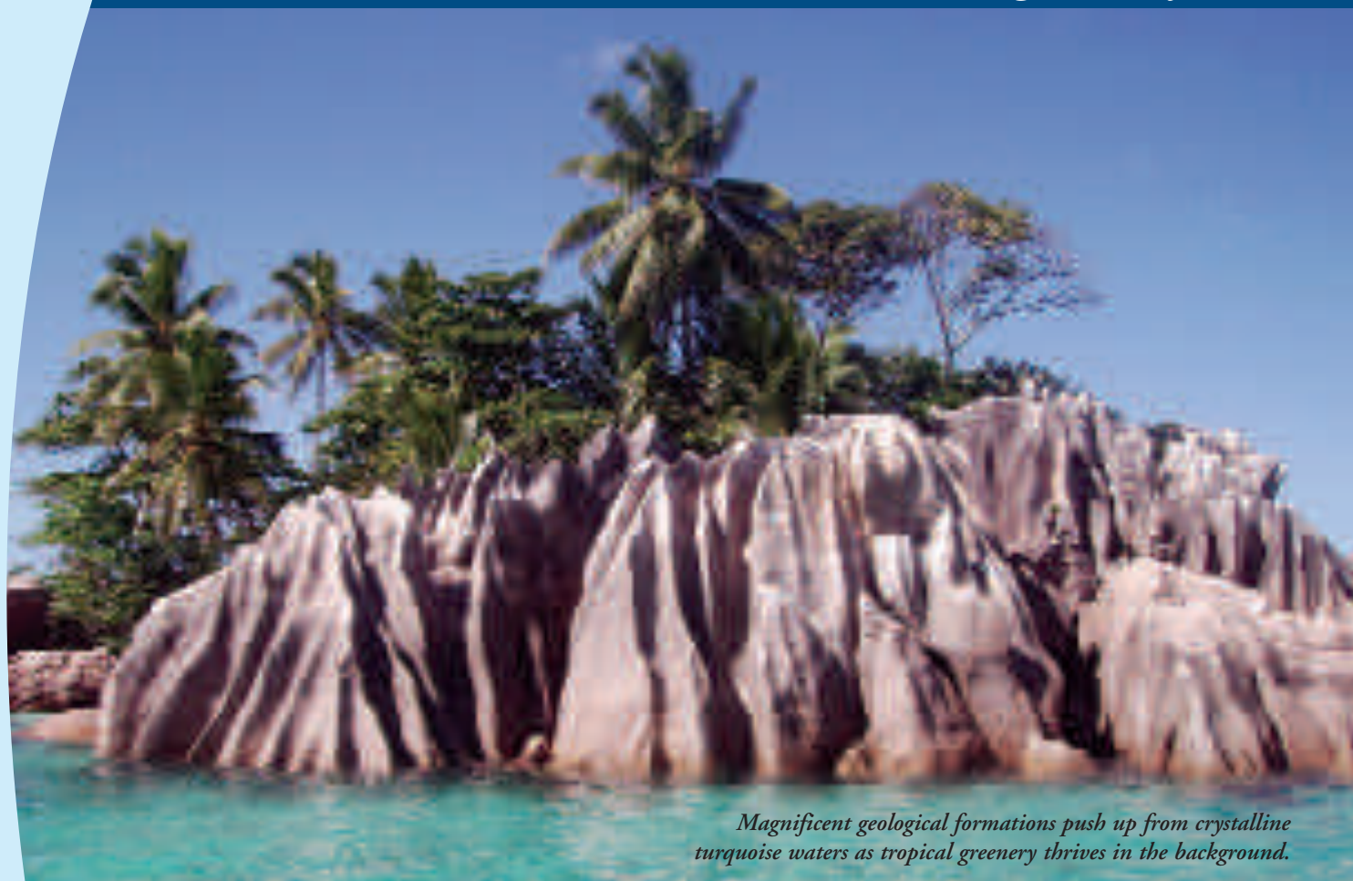
Magnificent geological formations push up from crystalline turquoise waters as tropical greenery thrives in the background.

As Pure as it Gets, Sailing the Seychelles •