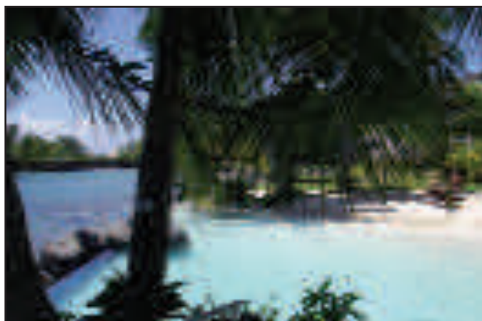
Resorts on this island paradise offer amenities to soothe and relax their guests. Lovely landscaping enhances natural tropical beauty.

The next day after a breakfast aboard of "pain au chocolat" and hot coffee, we pulled up the hook and