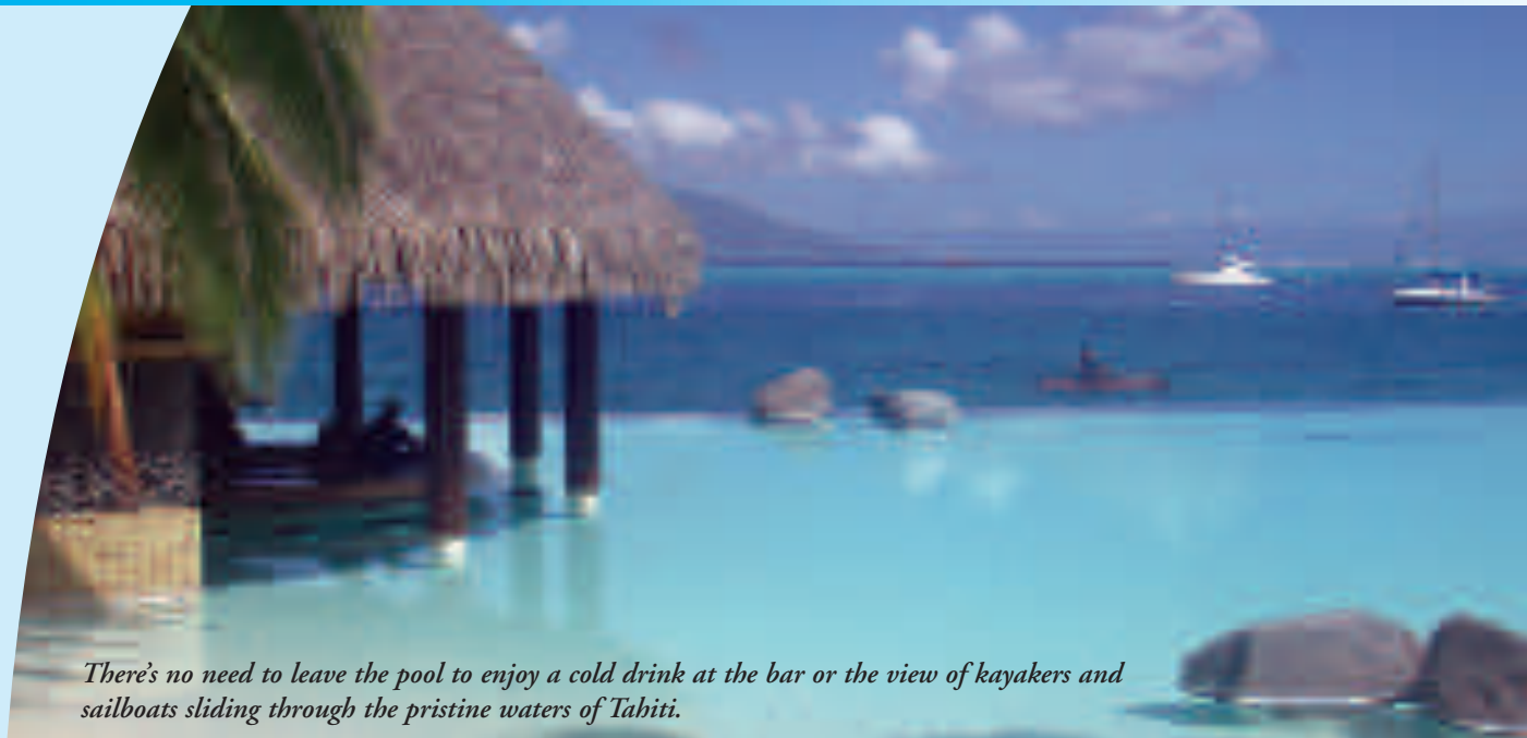
There's no need to leave the pool to enjoy a cold drink at the bar or the view of kayakers and sailboats sliding through the pristine waters of Tahiti.