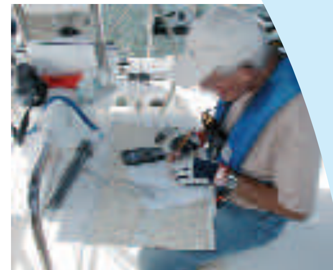
Teaching at Passion Yachts gets students out on the water, learning the practical skills of sailing while enjoying the beautiful areas surrounding Portland.

Known as "Bridge Town" because it surrounds both the Willamette and Columbia Rivers, Portland has a unique and large sailing community. We are a major destination for west coast sailboat cruisers because we have safe harbors in fresh water and plenty of local marine businesses to outfit your boat before heading back out to sea. From the waters of downtown Portland on the Willamette River to Hayden Island (the heart of the sailing community) on the Columbia River, dinghy racing, PHRF racing and fun Friday night "Beer Can" races