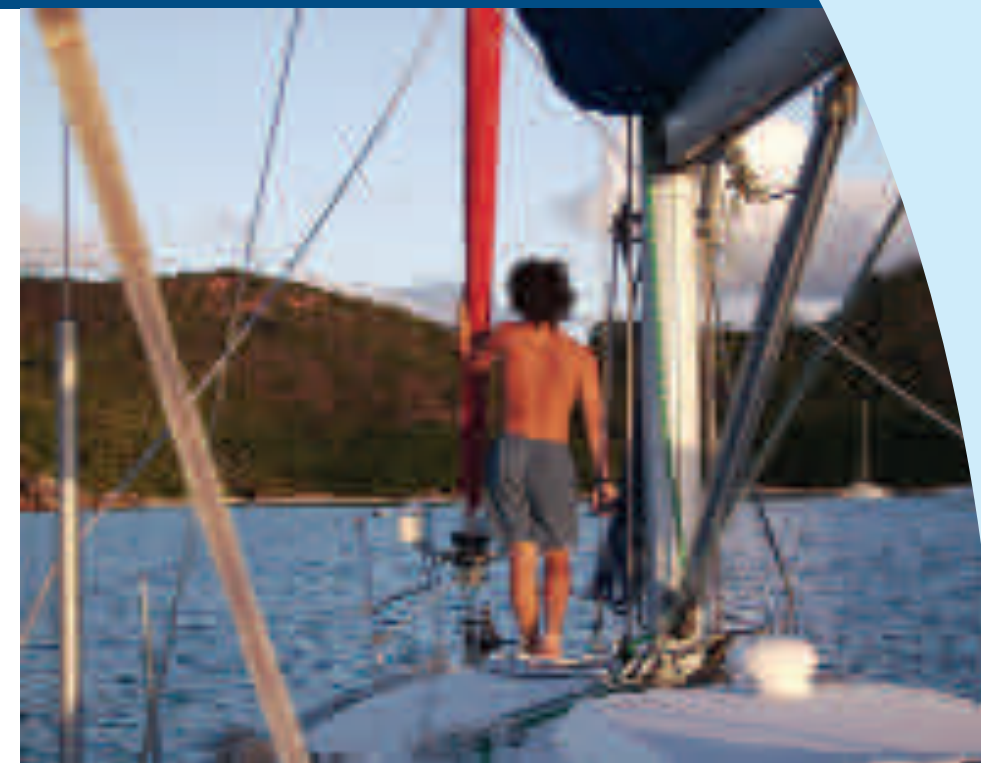
(Above) A sailor stands at the bow as the vessel approaches a serene anchorage in the Seychelles. (Below) A bamboo forest creates a canopy of green through which sunlight from the tropical blue skies filters down.

The beauty of sailing in Seychelles is the variety in every cove. On Anse Lazio, Praslin, is Bay Chevalier on the northwest corner. The beach is deep,