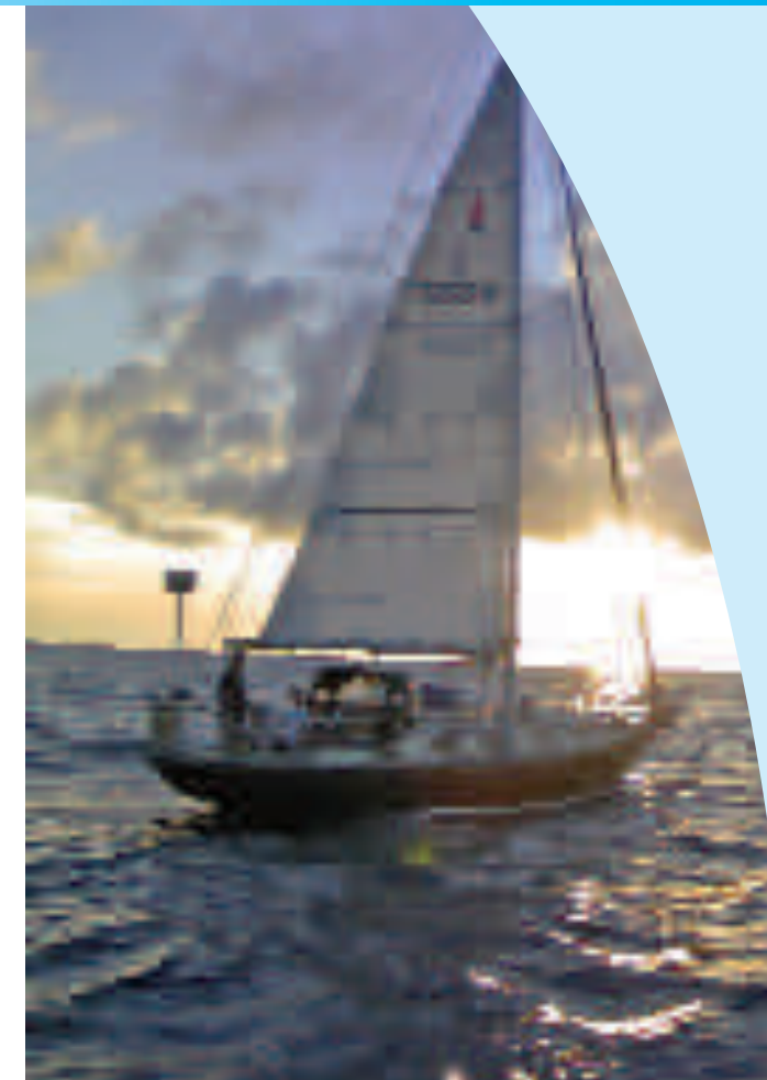
(Left) Using care when it's time for new bottom paint has advantages for you and the environment. (Above) The author sails along after powering out with his clean electric propulsion system.

Nobody wants to go swimming in a toilet. That's why we've established NDZs (No Discharge Zones) to keep our waters clean of sewage. Some locales have gone as far as limiting the discharge of gray water by establishing ZLDs (Zero Liquid Discharge Zones) because not everyone cleans their boat with the stuff that comes in the green package. Anchoring is another thing to consider. If you've ever had the misfortune of losing an anchor on a reef, you know that it can be a scary and expensive mistake. Not to mention, if you're a diver you know that the damage isn't only to the boat's gear inventory. Green boating also considers such things as this.