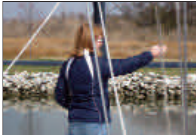
By using hand signals, the sailor at the bow of the boat can "talk" to the captain without shouting over the wind or engine.

What is the big difference? We have learned to use hand signals to give directions. A crew member standing at the bow merely needs to face forward and by moving an arm pointing forward, I know that I should continue directly ahead. Or by facing forward and pointing with the arm either to port or starboard, I know that I need to turn the vessel in that direction – the further the crew member points away from dead ahead, the harder I need to turn. We have our own signals as well for more speed, stop, reverse, etc. These are much easier to understand than shouted words into a howling wind and over top the loud engine noises. Using simple, clear hand signals (holding